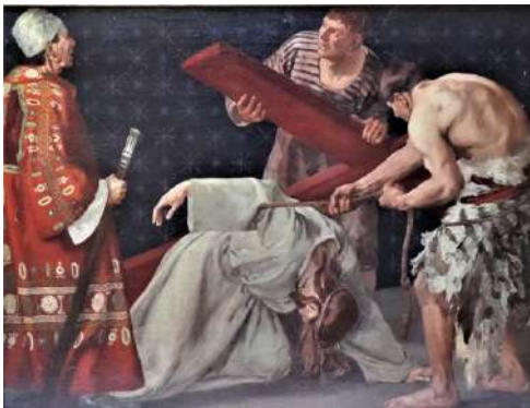
7. Christ's second fall