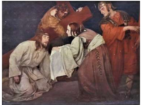
6. Christ's face is wiped by Veronica