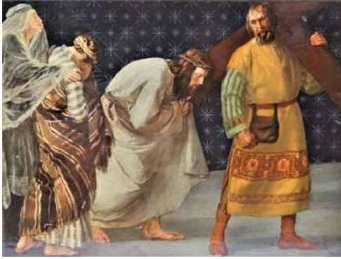
5. Simon of Cyrene is made to bear the cross