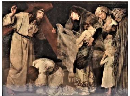
8. Christ meets the women of Jerusalem