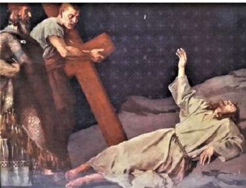
9. Christ's third fall